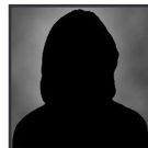
North & Central FL OPEN In the interim, please contact the following: Terry-Ann Orman (Greater/South Orlando) Jorge Ramirez (North FL, Panhandle, Jacksonville)

*For all other Specialty Groups, please contact the dedicated RIS in your region